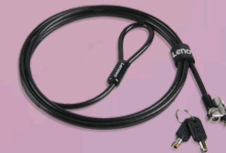
Kensington MicroSaver DS 2.0 Cable Lock from Lenovo 4XE1L68273