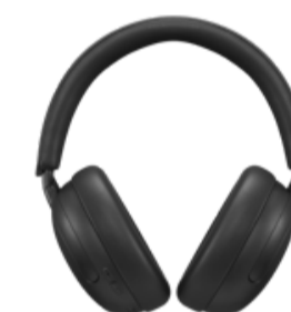
Lenovo Wireless Headphone 2000