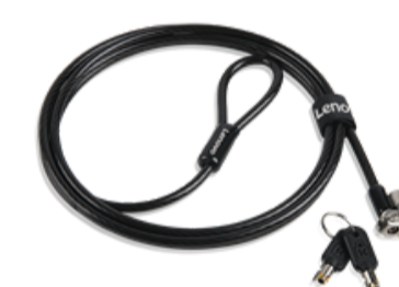
Kensington MicroSaver DS 2.0 Cable Lock from Lenovo