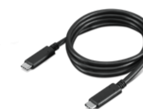
Lenovo USB-C Cable 1m