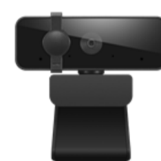
Lenovo 310 FHD Webcam Black