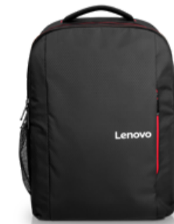
Lenovo 16" Laptop Everyday Backpack B510