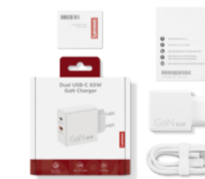
Lenovo Dual USB-C 65W GaN Charger