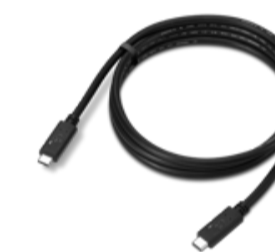
Lenovo USB 20Gbps USB-C to USB-C Cable 1.5m