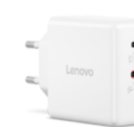
Lenovo Dual USB-C 65W GaN Charger