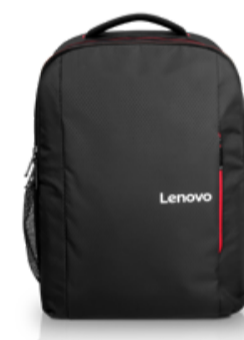
Lenovo 16" Laptop Everyday Backpack B510